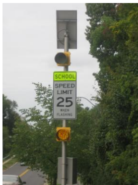
Figure 2. Example of school speed limit sign.

Generally, the reduced school speed limit zones should be in effect only during specified intervals such as at the start and end of a school day. While the transportation agency responsible for the roadway operations and maintenance installs the signs, the times are generally set through consulting with the local school district. Close cooperation is needed between school officials and those who operate the roadway.