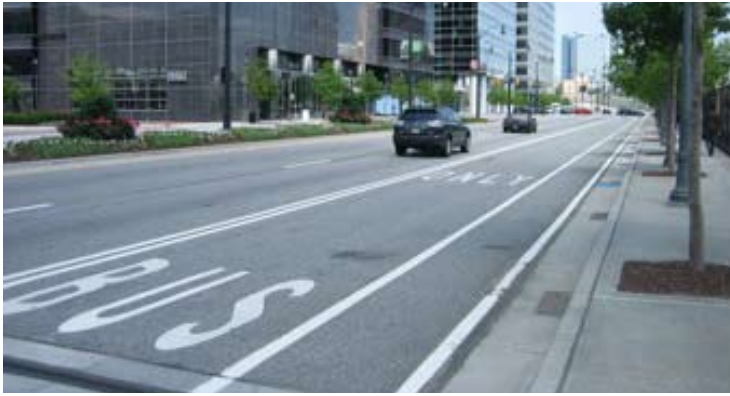
Figure 3 An example of an urban boulevard.

landscape architects. It is also useful to those in community leadership and advisory roles.