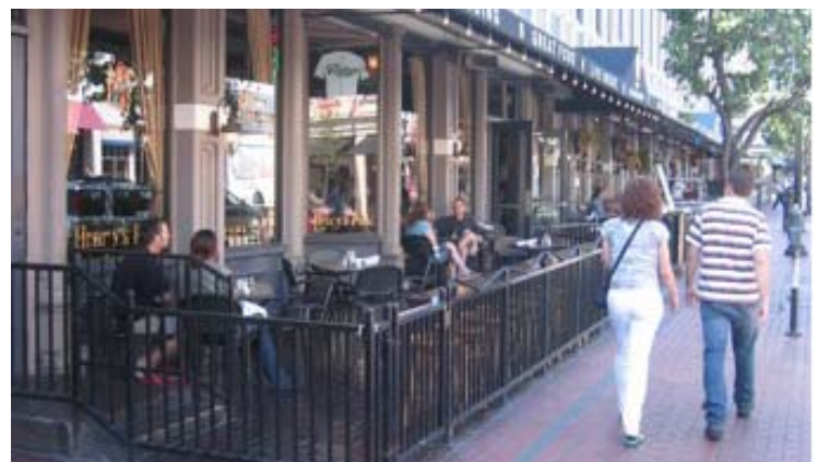
Figure 2 The streetside supports many urban activities.

The RP is for practitioners involved in the planning and design of walkable urban thoroughfares, including transportation engineers and planners, land use planners, urban designers, and