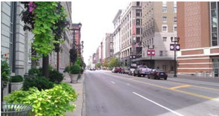
Figure 1 An example of an urban avenue.

A challenge in planning and designing thoroughfares is balancing the interests of all users and other stakeholders with those of the specific communities affected. While to the daily commuter, travel time and speed may be of primary importance, the community that is affected may view this goal as contrary to maintaining neighborhood integrity, overall livability, and safety. This concern is further exacerbated when other transportation services related to freight deliveries, emergency response, incident management, local business access, and transit operations are considered. In urban areas the design of thoroughfares to accommodate all users is particularly challenging, especially where there is limited opportunity to expand or alter the public right of way. In response to this challenge, the Institute of Transportation Engineers (ITE) has published guidance on designing walkable urban thoroughfares.