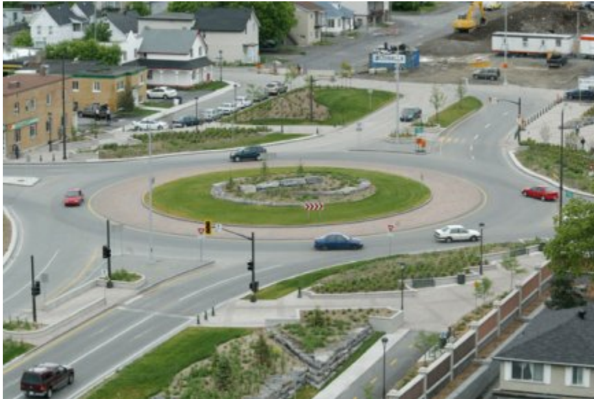
Figure 3: Two-Lane Roundabout with Offset Pedestrian Crossing and Pedestrian Signals in Gatineau, Que

An example of enhanced pedestrian crossing measures at a multi-lane roundabout is from the Boulevard des Allumettières in Gatineau, Quebec, where there is a two-lane roundabout with offset (zig-zag) crosswalk and pedestrian signals. This configuration can be beneficial for accommodating both VI and non-VI pedestrians alike.