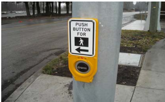
Figure 2: Example of an Actuation Device

APS devices are devices that can be actuated by a pedestrian to control the movement of vehicle traffic. In this case, it would require the vehicle traffic to stop to make a crossing gap for pedestrian movement. The VI pedestrian can hear the signal and hear and feel the actuation device (pushbutton). These devices omit a distinguishable sound. Many jurisdictions use a combination of bird sounds, such as a cuckoo for north-south crossings and a peep-peep or chirp tone for east-west crossings. The pushbuttons can also emit a tone to signal the location of the device and the surface can be tactile to transmit information to the VI such as the direction of the crossing and the type of crossing.